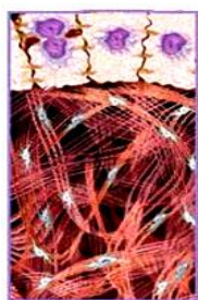
25 years skin