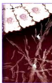
85 years skin